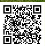
CHEYENNE COUNTY, NE