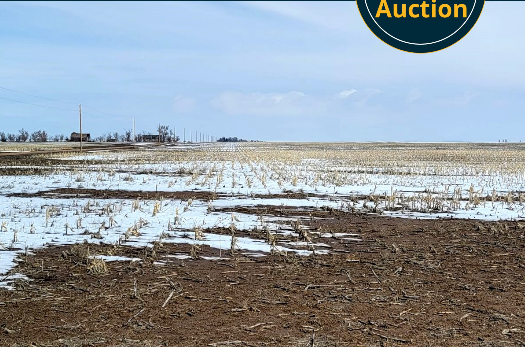
CHASE COUNTY, NE